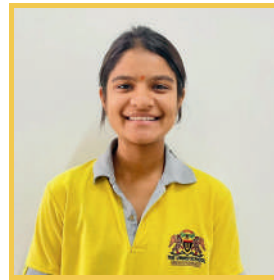
Jagriti House Captain