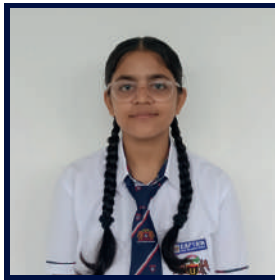
Angel House Captain